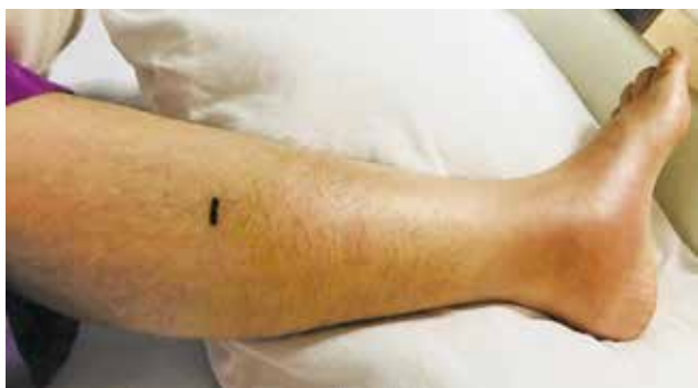
Fig 1: Swelling of the left leg